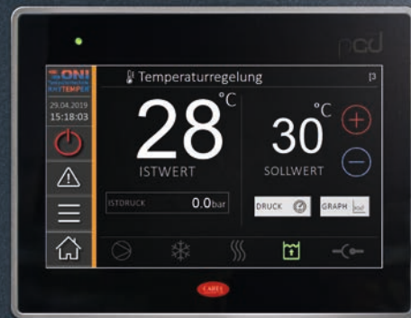
User friendly PLC controller with 7 inch touchscreen display

Via the interface, the temperature control unit can be connected to the RHYTEMPER® FlowControl, FlexControl, FlowWatch or HotPulse regulating unit for communication and used for remote adjustment.